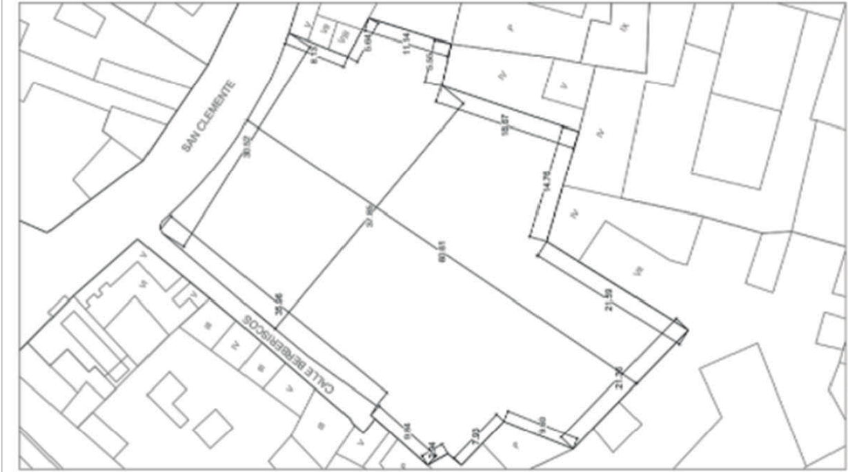
PLANO DE SITUACIÓN 1.108